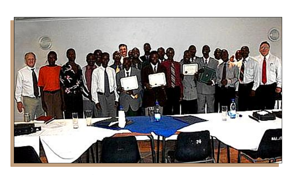
Graduation, - Malawi, E.A.